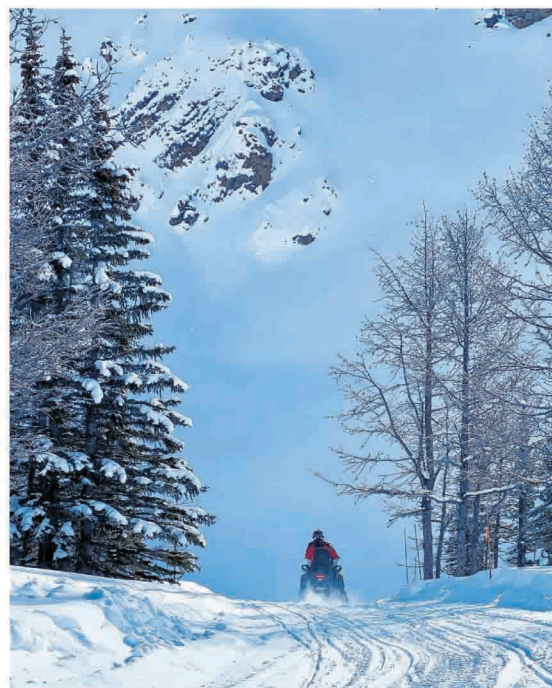
Snowmobiling high up in an alpine bowl with Toby Creek Adventures.