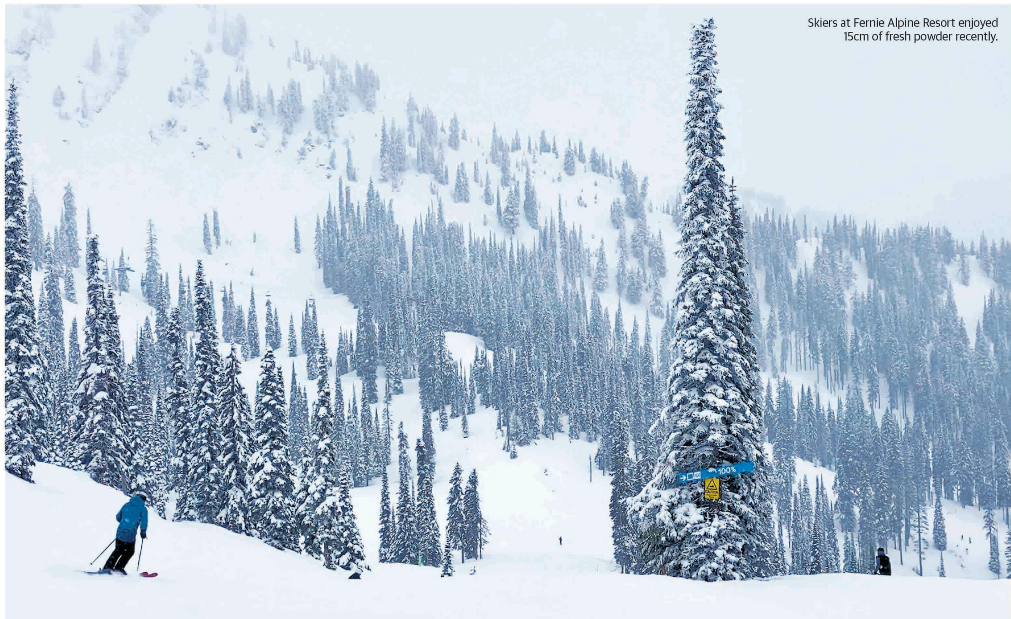
Skiers at Fernie Alpine Resort enjoyed 15cm of fresh powder recently.