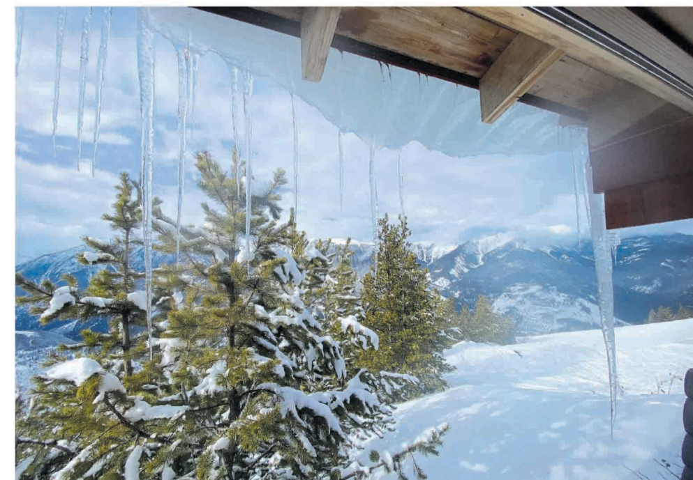
The view from Elkhorn Cabin at Panorama Mountain Resort, where skiers stop for Swiss raclette. Panorama is in the Purcell Mountain range with views towards the Rockies.