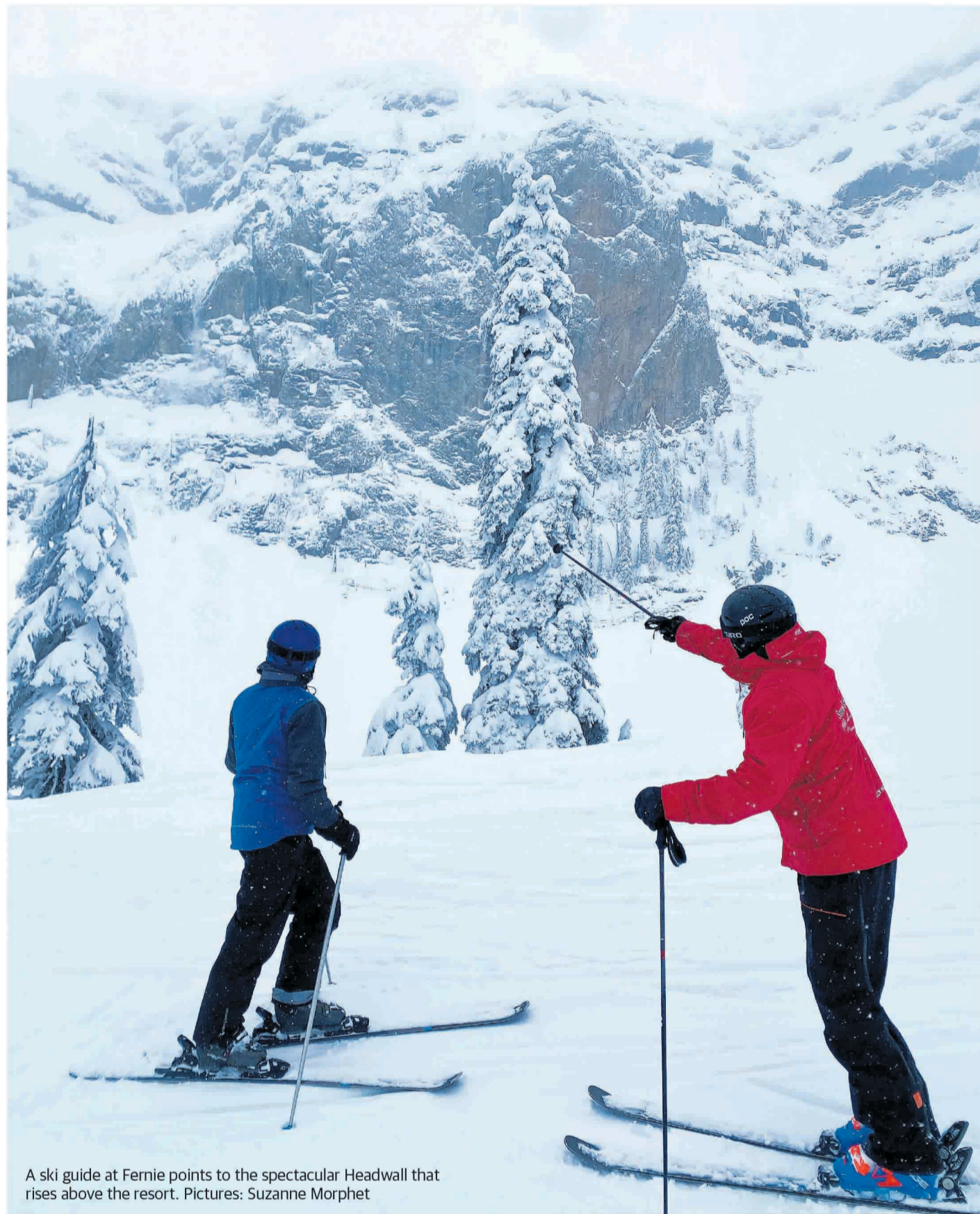
A ski guide at Fernie points to the spectacular Headwall that rises above the resort.

Given this season's weird weather, we're surprised to find great conditions. The secret is Panorama's enormous snow-making capability. With more than 300 snow guns, many portable, this resort doesn't depend on Mother Nature. "Instead of having to strategically plan your runs based on what's